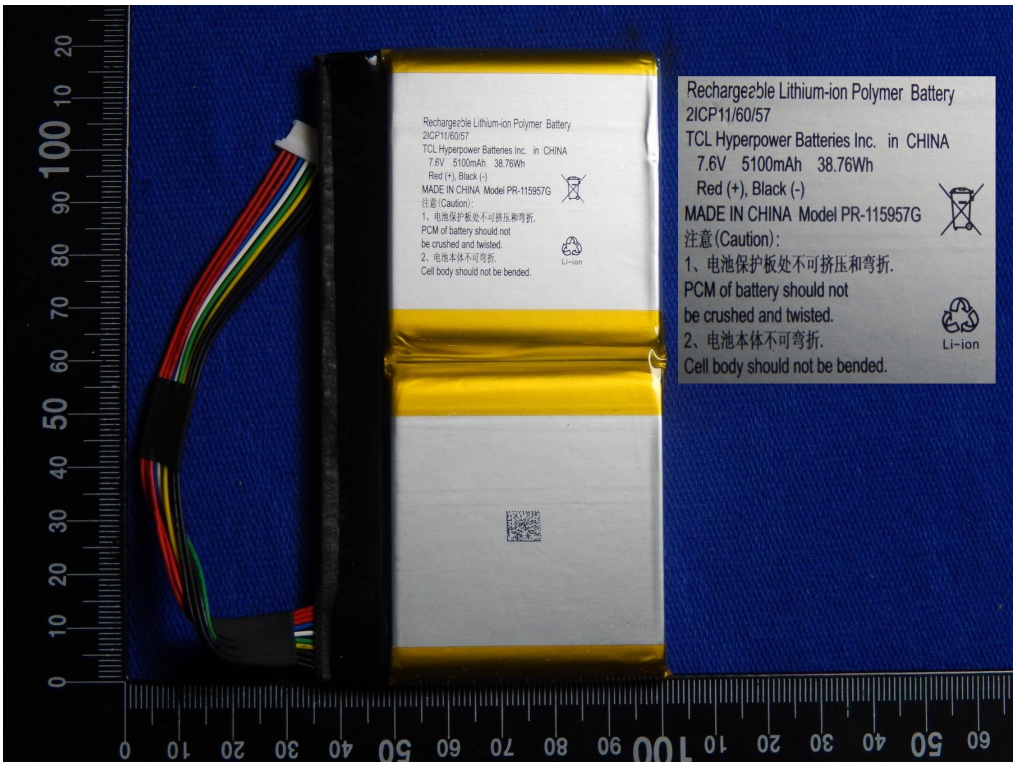
Battery (PR-115957G 7,6V 5100mAh 38,76Wh)